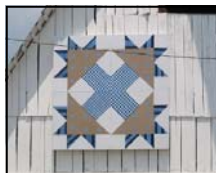
C. Earhart Farm: Tulip Variation

When viewing and enjoying the Quilt Trail use caution when slowing or stopping near a site. Stopping along busy roads can be dangerous and illegal. All sites are on private property and should be viewed from the public road unless otherwise indicated at the site if it is a business open to the public. We are indebted to our barn hosts for their generosity.