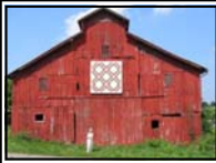
Massengill Farm: Triple Irish Chain